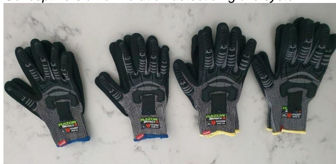
Prototype gloves currently on trial

The glove system can measure the wrist angle and measure vibration frequency at the fingertip, all data is displayed in real time with real time alerts. It's all exciting stuff.