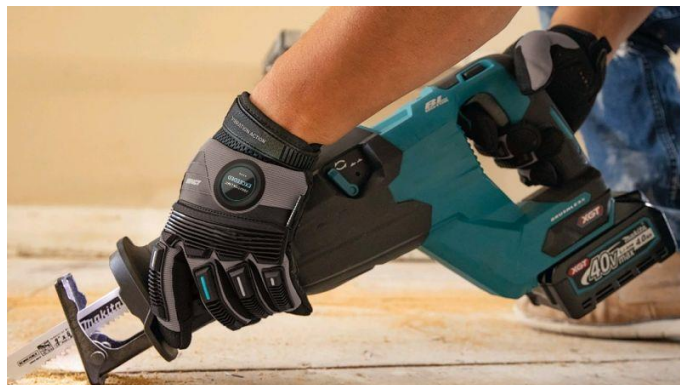
Concept version of vibration detection glove system

Vibration Action is currently working with CHASNZ in conducting a trial with a national company within the construction sector. The company has a large number of Filipino workers (English as a second language), so he has developed a handout in Filipino to help communicate the dangerous of HAVS.